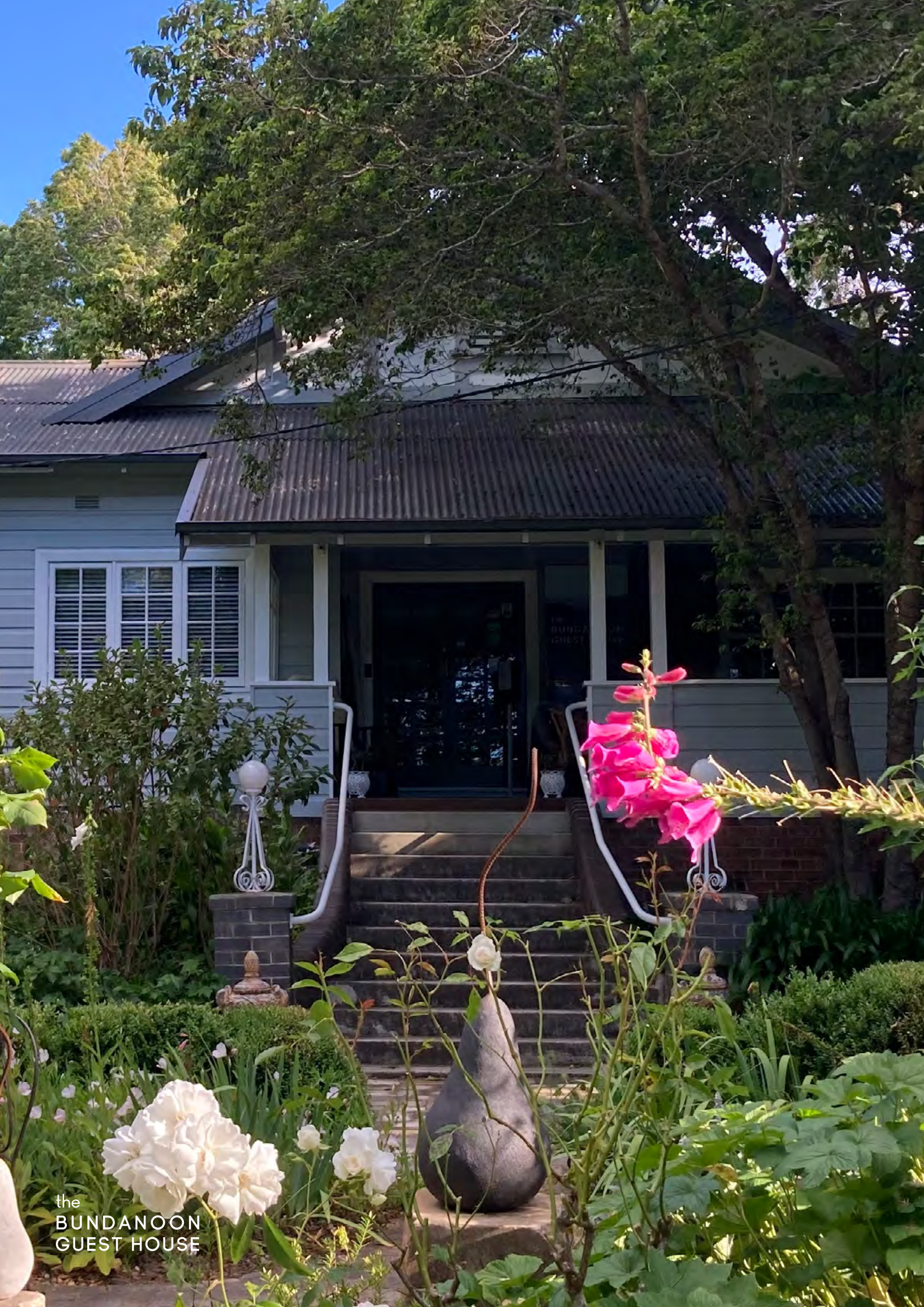
the BUNDANOON GUEST HOUSE